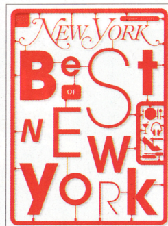
Tom Brown Art+Design (TBA+D)