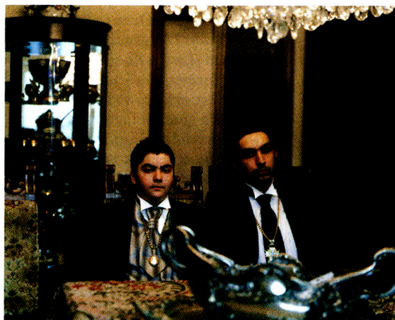
Hannah Collins, Untitled (dos hermanos, Moscú) (Two Brothers, Moscow), 2006, color photograph, 43 3/4 x 54".

In dealing with such highly sensitive subject matter—people who live on the border of poverty and social exclusion—it is reasonable to wonder if, with this work, the artist is subject to what could