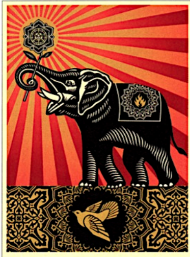
Shepard Fairey's Obey Elephant , 2009.