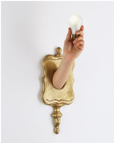
Jamie Isenstein, Magic Lamp , 2005, plaster, gold leaf finish, epoxy, velvet curtain magic light bulb, "Will Return" sign or arm Dimensions variable, Image courtesy artist and Andrew Kreps Gallery, New York Collection Stefano Basilico, NYC