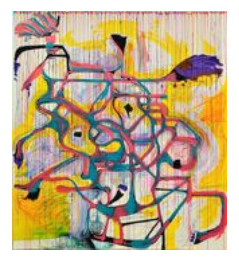
Joanne Greenbaum, "Untitled" (2014), oil, oil crayon, acrylic, and ink on canvas

If, as Walter Pater claimed, all art aspires to the condition of music, then Greenbaum's music is neither symphonic nor mellifluous, landing somewhere between dissonance (chaos) and harmony (order). In order to achieve this in-between state, she endows every conglomeration of marks with its own space, where it moves at its own rhythm without regard to whatever else is unfolding in the painting's rectangle. The lines of a colored pencil may be quicker, less dense and more sinuous than those of a brushstroke of oil paint, for example, but the one doesn't infringe upon the other. The drips, which start from a painting's top edge, move at still another speed. And behind the drips lurk faded washes of color and an airy mass of curling and meandering lines. Meanwhile, colors collide, support, frame, inflect, or stand apart.