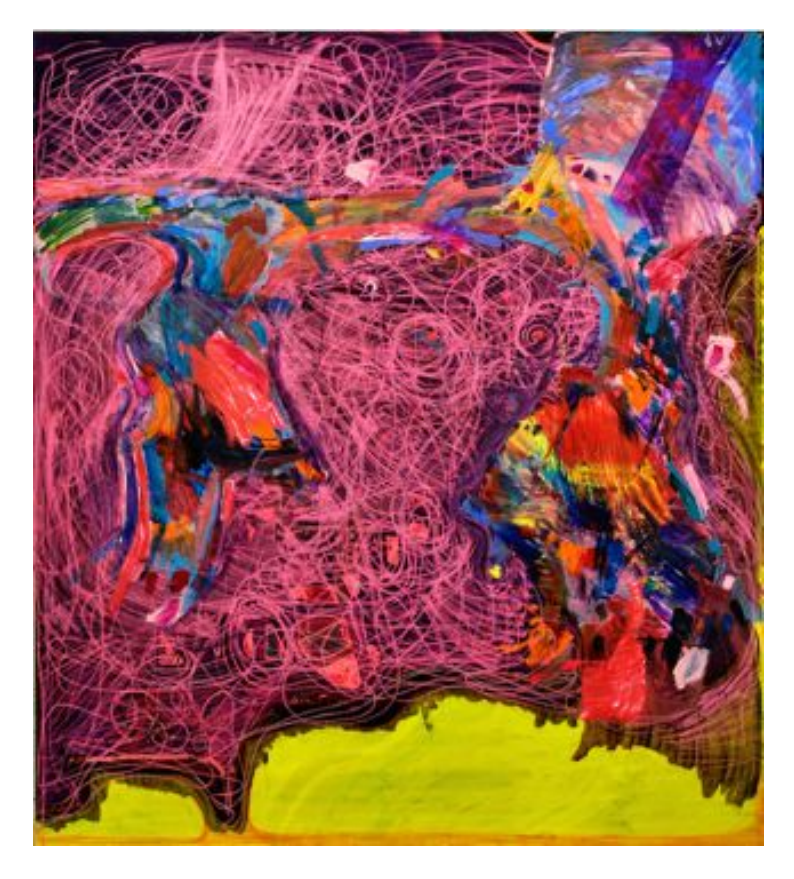
Joanne Greenbaum, "Untitled" (2014), oil, ink, acrylic, and flashe marker on canvas

What further distinguishes Greenbaum from her contemporaries is that she achieves her disruptions without resorting to collage or the appropriation of past styles; nothing feels arbitrary. Her paintings aren't all of a piece, but they aren't mash-ups either. That's what I mean by achieving a difficult and seemingly impossible balance. The other distinguishing feature is the different speeds and kinds of movements she's able to pack into a single work without making it feel claustrophobic or crammed. Our attention darts around, focusing and refocusing, as if trying to follow swarms of birds circling and swooping. While there is little stillness in her work, constant agitation isn't her objective either.