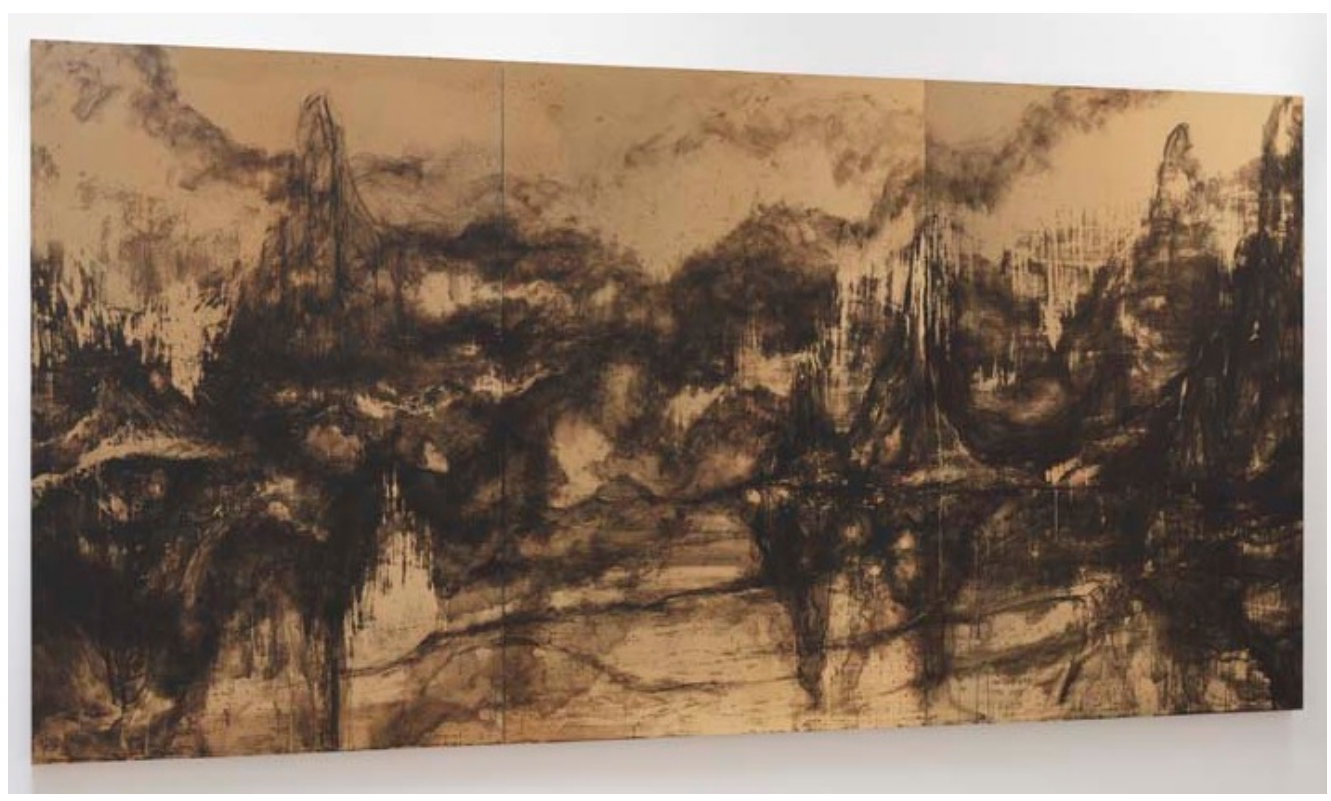
Golden (Panorama), 2013, gold chroming and India ink on wood panel, 182.9 x 365.8 cm.

407 Pedder Building, 12 Pedder Street Central, Hong Kong