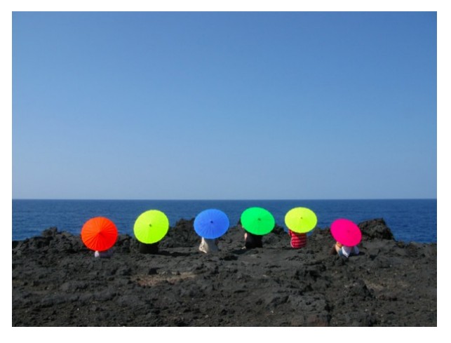
Peter Saville performance in Stromboli, 2013.