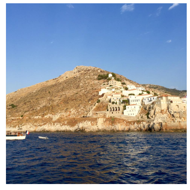
The Island of Hydra.

Edinburgh Art Festival runs from July 28-August 28 2016