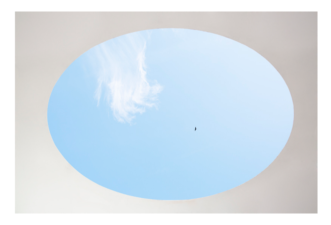
James Turrell Albion Barn (2012).

(https://news.artnet.com/art-world/hotel-art-museum-quality-collections-318652)