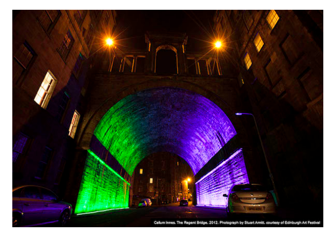
Callum Innes Regent Bridge (2012).

The 5th Moscow International Biennial for Young Art opens this weekend and runs until August 10