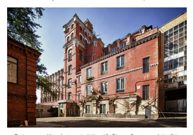
Trehgornaya Manufactory, building #5.

Volcano Extravaganza in Stromboli runs from July 15-21