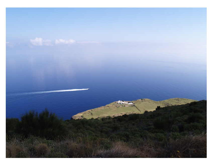
Stromboli.