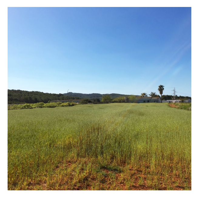
The site of the new sculpture park