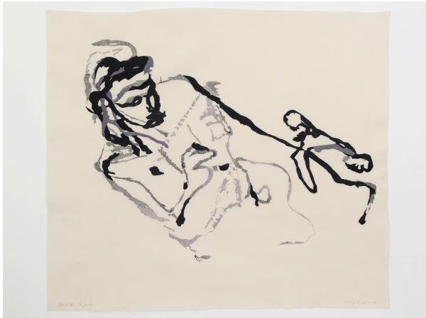
Tracey Emin, Portrait from the past , 2014, embroidered cotton, 50.39 x 57.09 in (128 x 145 cm).