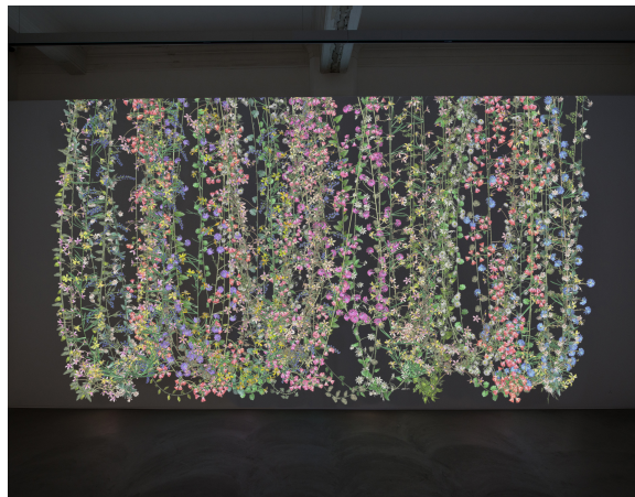
Jennifer Steinkamp, Garlands 1 , 2013, video installation, dimensions variable.