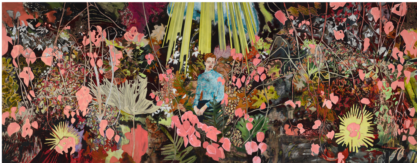
Hernan Bas, The Guru , 2013-14, acrylic on linen, three panels, each: 84 x 72 in (213.4 x 182.9 cm); overall dimensions: 84 x 216 in (213.4 x 548.6 cm).

Art Basel Hong Kong Booth 1C09 May 15-18, 2014 Hong Kong Convention and Exhibition Centre (HKCEC), Hong Kong