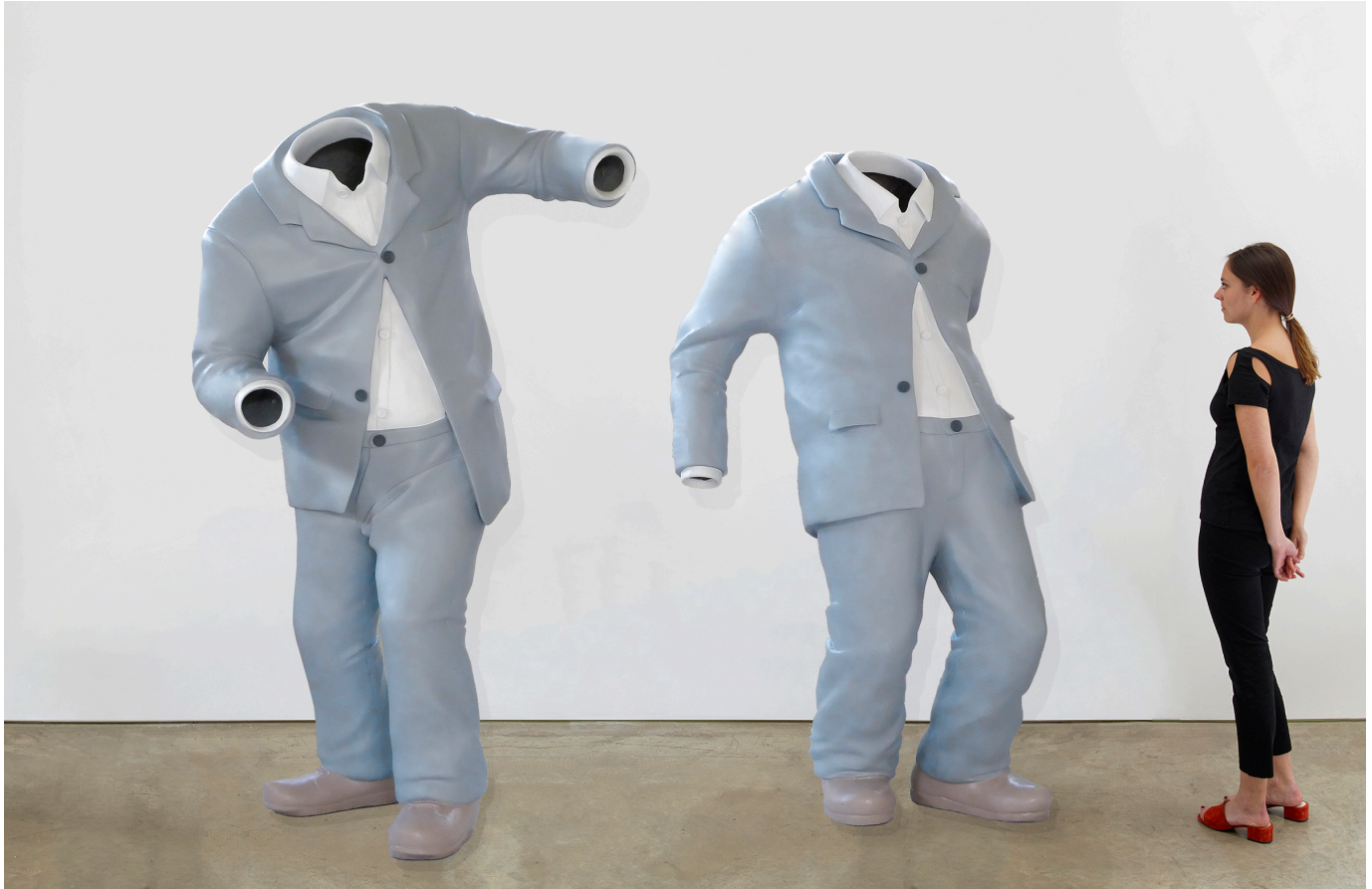
ERWIN WURM, Big Disobedience , 2016, aluminum, paint, 78.74 x 39.76 x 39.76 in, 200 x 101 x 101 cm (part 1), 81.1 x 41.34 x 43.31 in, 206 x 105 x 110 cm (part 2). Edition of 3.

#erwinwurm | #bigdisobedience | #lehmannmaupin