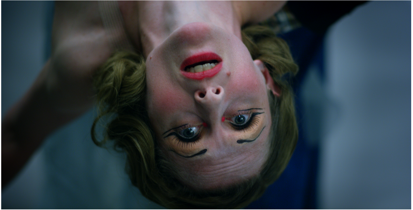
ALEX PRAGER, La Grande Sortie , 2015, 6 archival pigment prints, single-channel video with color and sound on blue-ray disc and thumbdrive, 11 x 21 in, 27.9 x 53.3 cm (image), 17 x 22 in, 43.2 x 55.9 cm (print), duration: 10 minutes. Edition of 6. Commissioned for the Opéra national de Paris 3è Scène.

#alexprager | #lagrandesortie | #lehmannmaupin