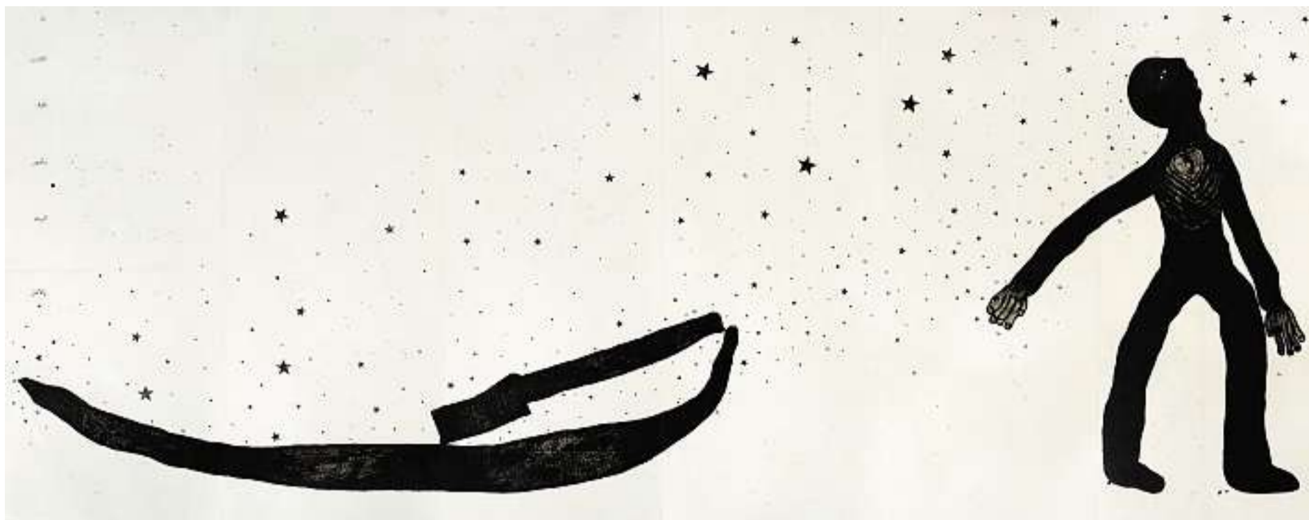
Take Your Boat and Abandon Your Home from Ali's Boat series, 2014, Indian ink, charcoal on canvas