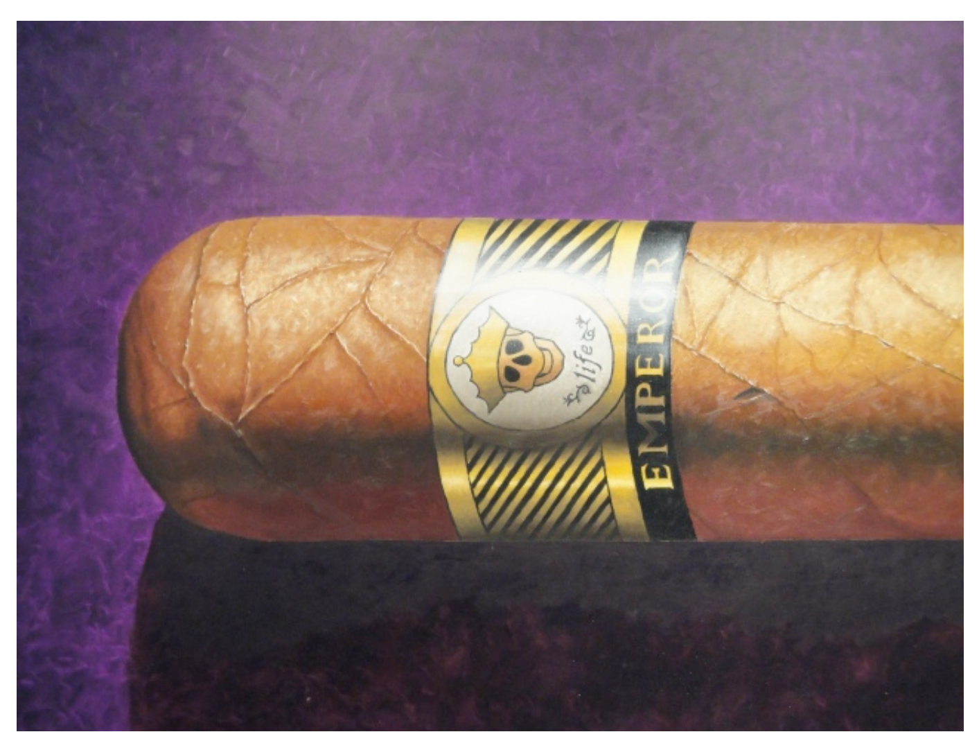
the purple side of cigar