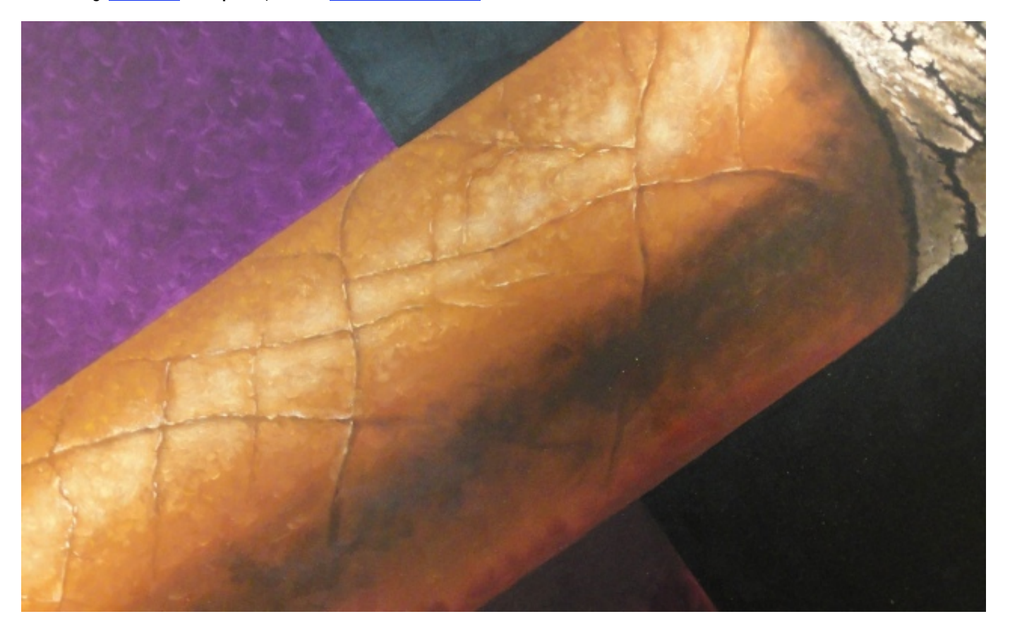
"I am not interested in power for power's sake, but I'm interested in power that is moral, that is right and that is good." ~ Martin Luther King, Jr.