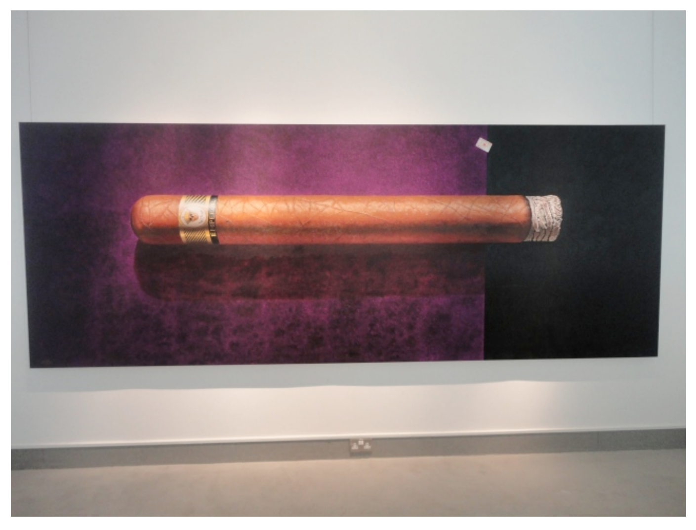
Oil on Canvas

As you noticed, all Othman's artworks featured an armed chair covered with carpet, different in details, yet one theme. But this was the only one with a huge expensive cigar, divided into two parts: luscious deep purple & darkest shade of black with an Ace card on top of the 'burning' line. One side is lit up, going on its way to the end. What does it mean?