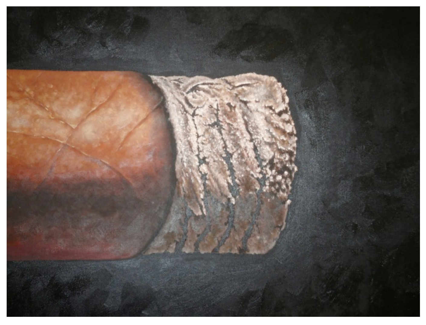
the black lit side

This amazing painting symbolizes Othman 'optimistic' look to the future of the 'Thrones'. He believes that people's well, determination & revolution will won over bloody dictatorship, no matter of how long it might take it will happen eventually. Othman proves people's victory by adding the Heart Ace Card on top, if you play cards, you will know that an Ace is the highest & most powerful card that takes over King. Yes! Othman was realistic with the 9 'Throne' paintings cascading sometimes with a sarcastic touch painful reality, but he has a vision & strongly believes in by reflecting it on a different artwork. Strong, sarcastic, shocking, realistic & optimism is what Othman Moussa leaves you with after visiting his 'Thrones'.