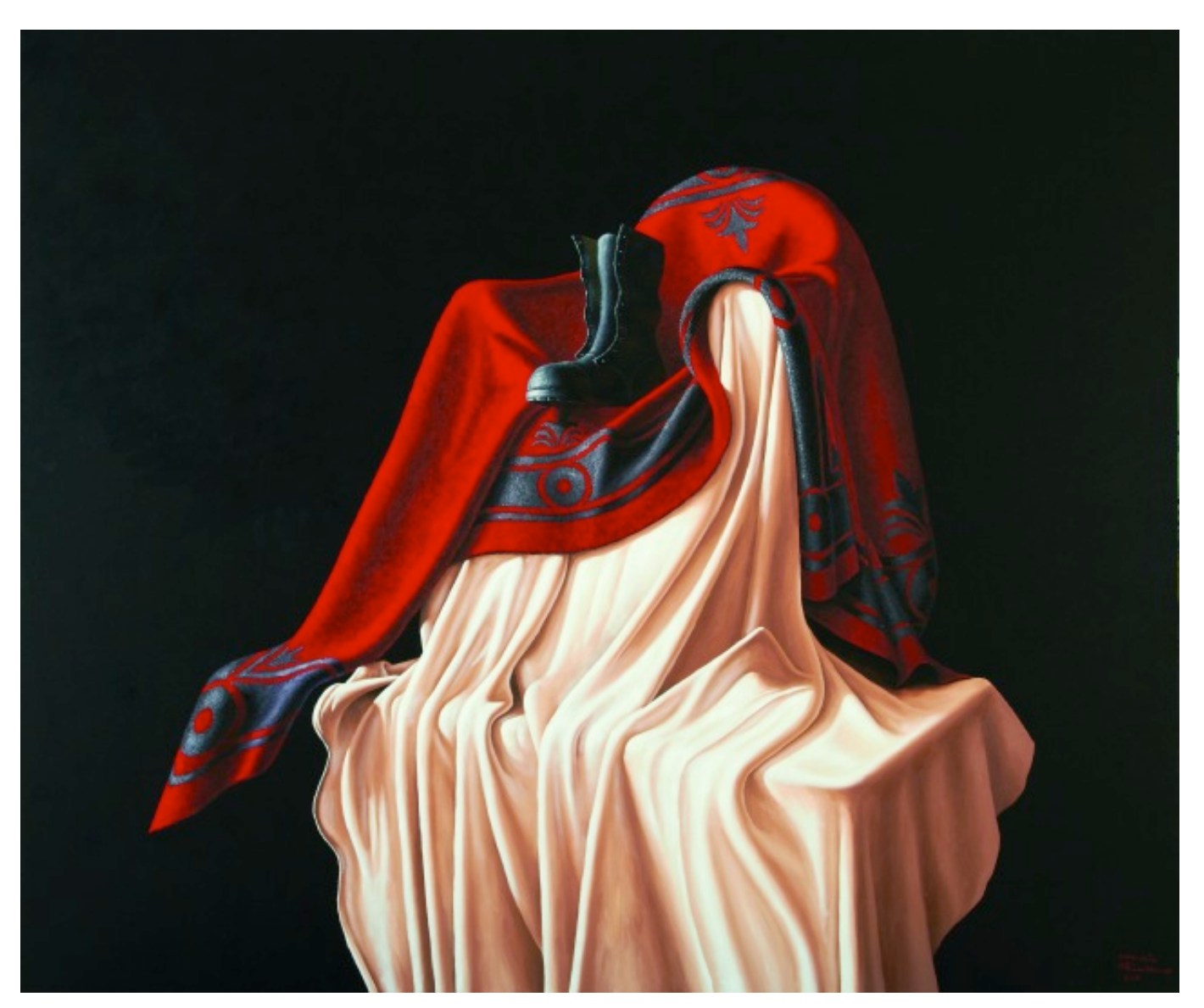
'The King 3' 150 X 180 cm Oil on Canvas

'The Throne' is an exceptional example of the degree of artistic realism still prevalent in contemporary art, as well as a biting satire of the present-day political ambitions and policies of world leaders."