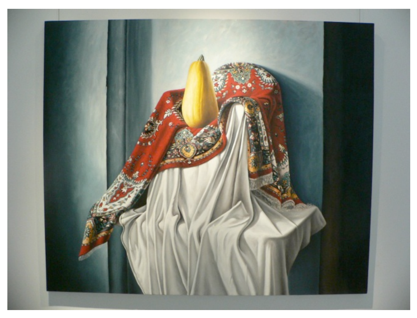
'His Majesty King Yellow' 150 X 180 cm Oil on Canvas