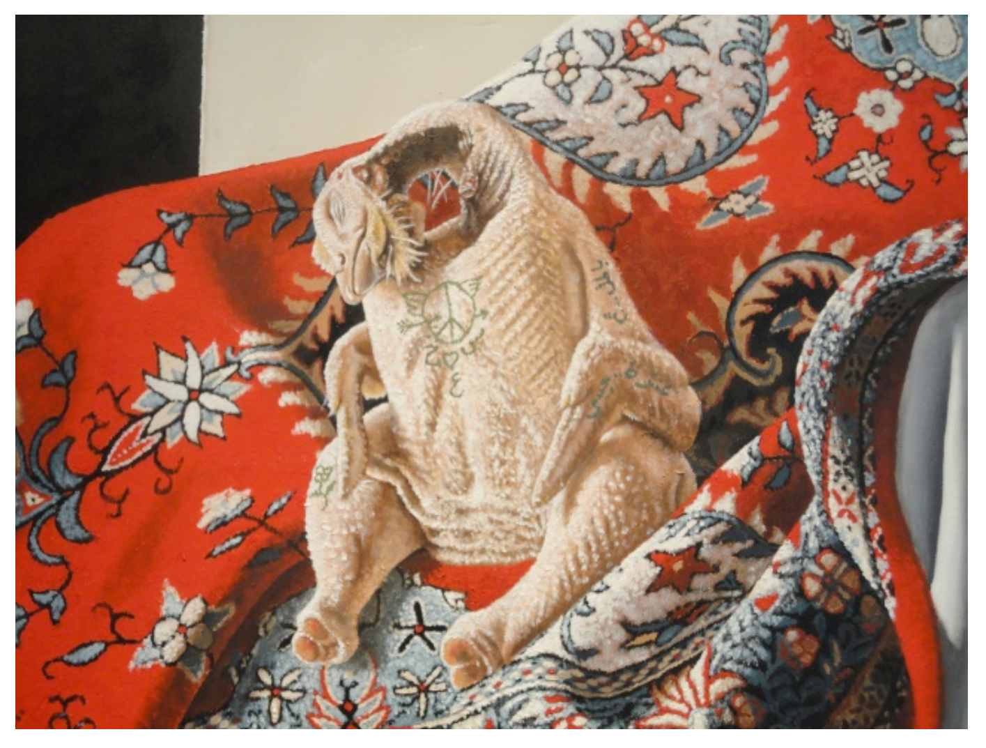
Details from 'The King of Peace' 150 X 180 cm Oil on Canvas