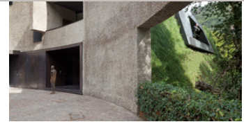
Who to Watch in Poland Mark Magazine latest issue