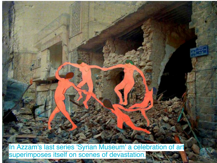
In Azzam's last series 'Syrian Museum' a celebration of art superimposes itself on scenes of devastation.