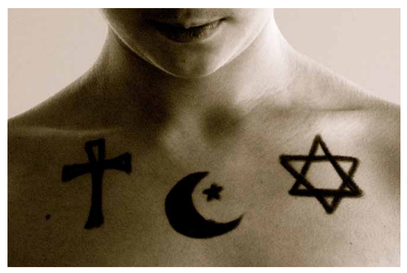
Starts With Religion, Toby for Peace series, 2011, Photography, 80x100 cm

complete mental, emotional, psychological, physical, spiritual and of course, artistic, rebirth ).