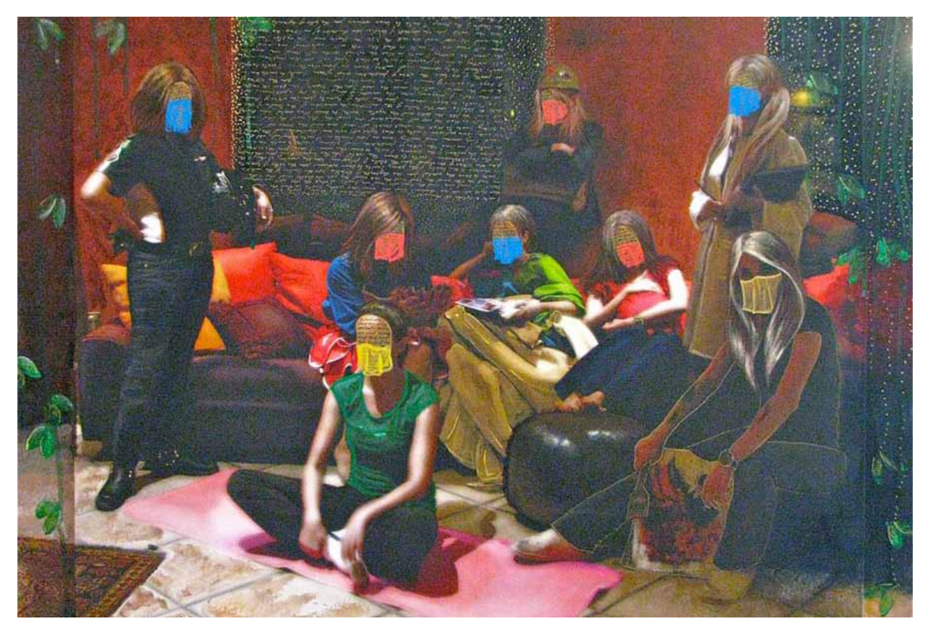
Is There a Problem Baby? The Bullet Series, 2010, Acrylic painting with photography on canvas and wood, 120x140cm

more international platform. "People were asking me – rhetorically I assume - 'Where did you come from? Where've you been hiding?' and I find that amusing because I've been painting all my life, and exhibiting for 20 years (does my first solo show at 9 years of age count?)", she responds laughing.