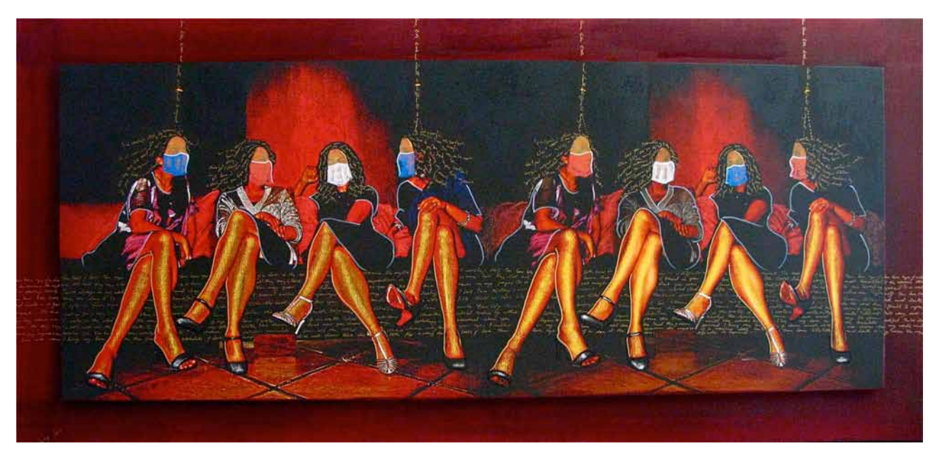
Medusas Resting, The Bullet Series, 2010, Acrylic painting with photography on canvas and wood, 80x170cm

Considered one of Kuwait's foremost artists and poets, Shurooq Amin works form an ideology of distinct resolution and convergence. A free spirit anchored resolutely in an unflinching vision, she creates thoughtprovoking art, pushing the boundaries of her society. The polarity between East and West is the backbone of her images, as is her own struggle as an artist in Kuwait. Shurooq has had to overcome not merely patriarchal but also societal stereotypes. As such, for the last three years, she has embarked on a raw exploration of modern Arabian Gulf society. She began her journey with researching the secret world of women in Kuwait, entering their homes, allowing them into hers, being privy to the delicate nature of the double lives most lead, and henceforth documenting her findings with photographs that eventually became self-contained staged photo-shoots of images that do not profess to demean or criticize, but to exaggerate with an incongruent tongue-in-cheek quality the nature of these double lives. She uses these photographic documents