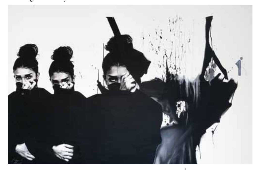
The First Timer 2012 Oil on Canvas 150 x 300 cm

The hands of the figure in the center of the composition differentiates her from the other two figures whose arm wraps protectively around the waist while the other raises the cowl neck. Clasped within the palm of her closed hands is the grip of a handgun. Her eye focus shifts from the viewer to