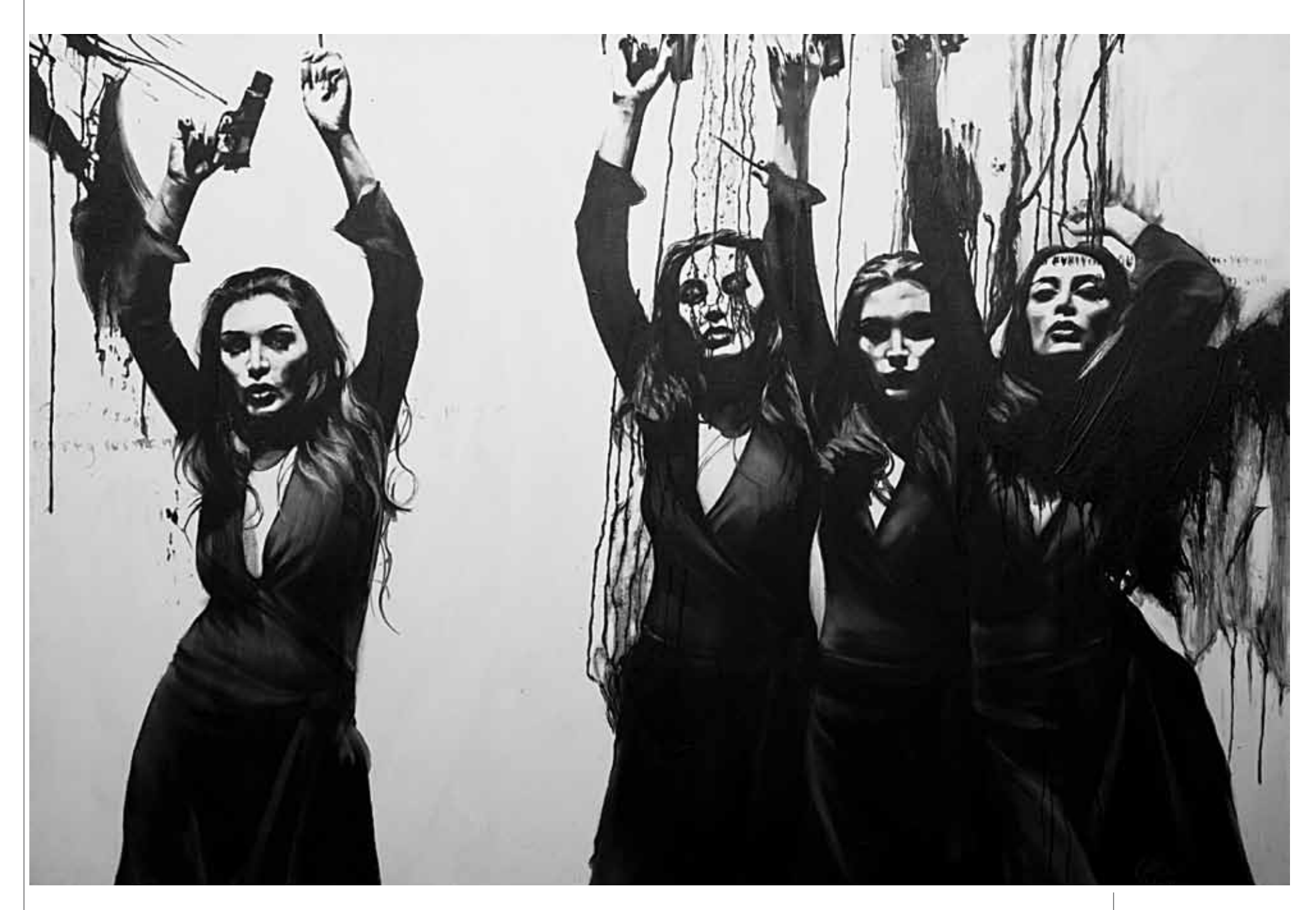
Real Drink Electronic Music 2012 Oil on Canvas 100 x 150 cm