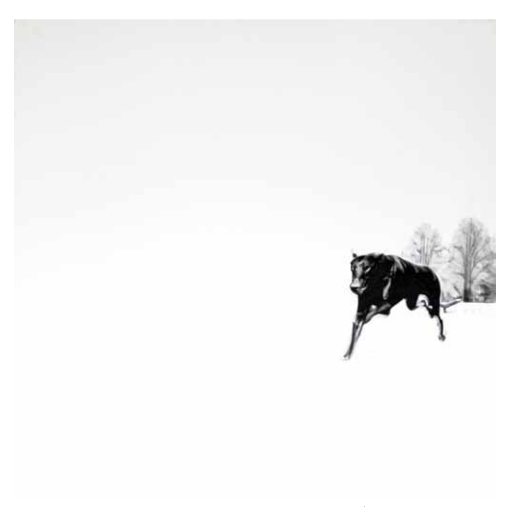
Lonely (Detail) 2012 Oil on Canvas 100 x 300 cm