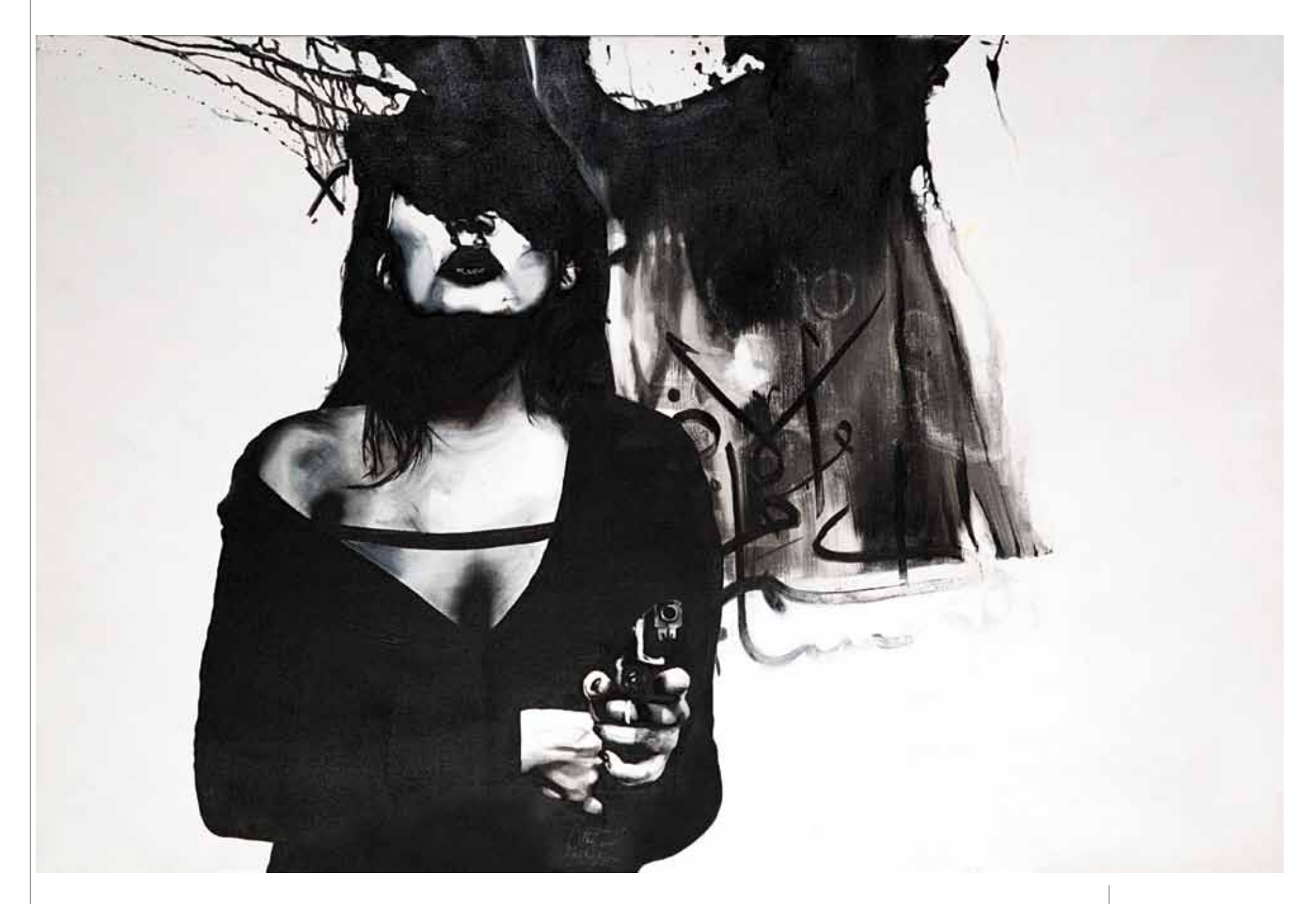
Revenge 2012 Oil on Canvas 100 x 150 cm