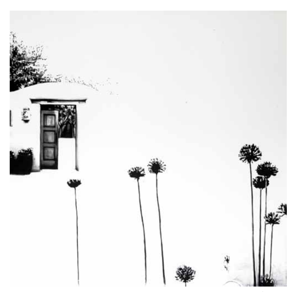
Lonely (Detail) 2012 Oil on Canvas 100 x 300 cm