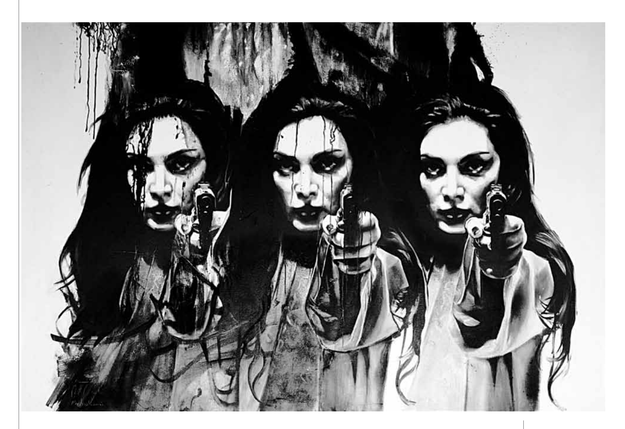
Join Now 2012 Oil on Canvas 100 x 150 cm