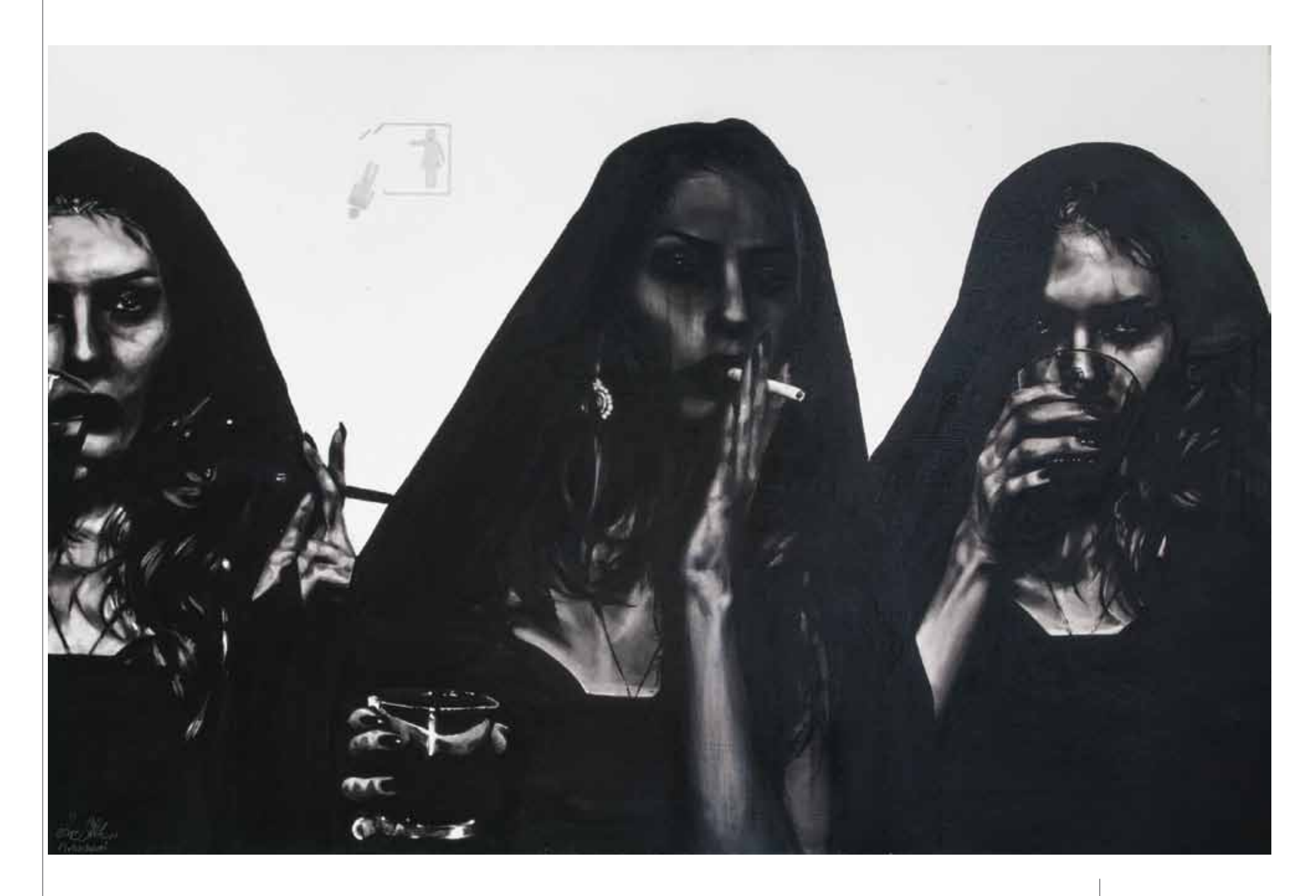
Untitled 2012 Oil on Canvas 100 x 150 cm