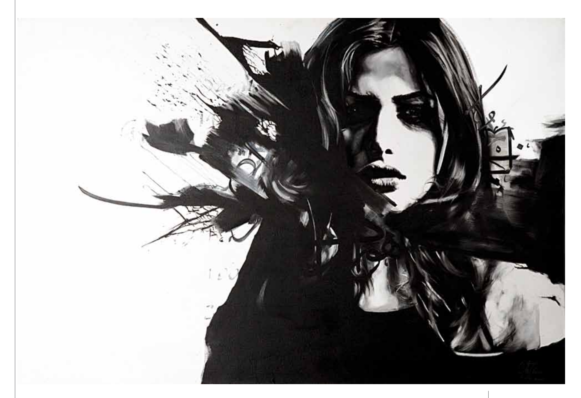
Betrayal 2012 Oil on Canvas 100 x 150 cm