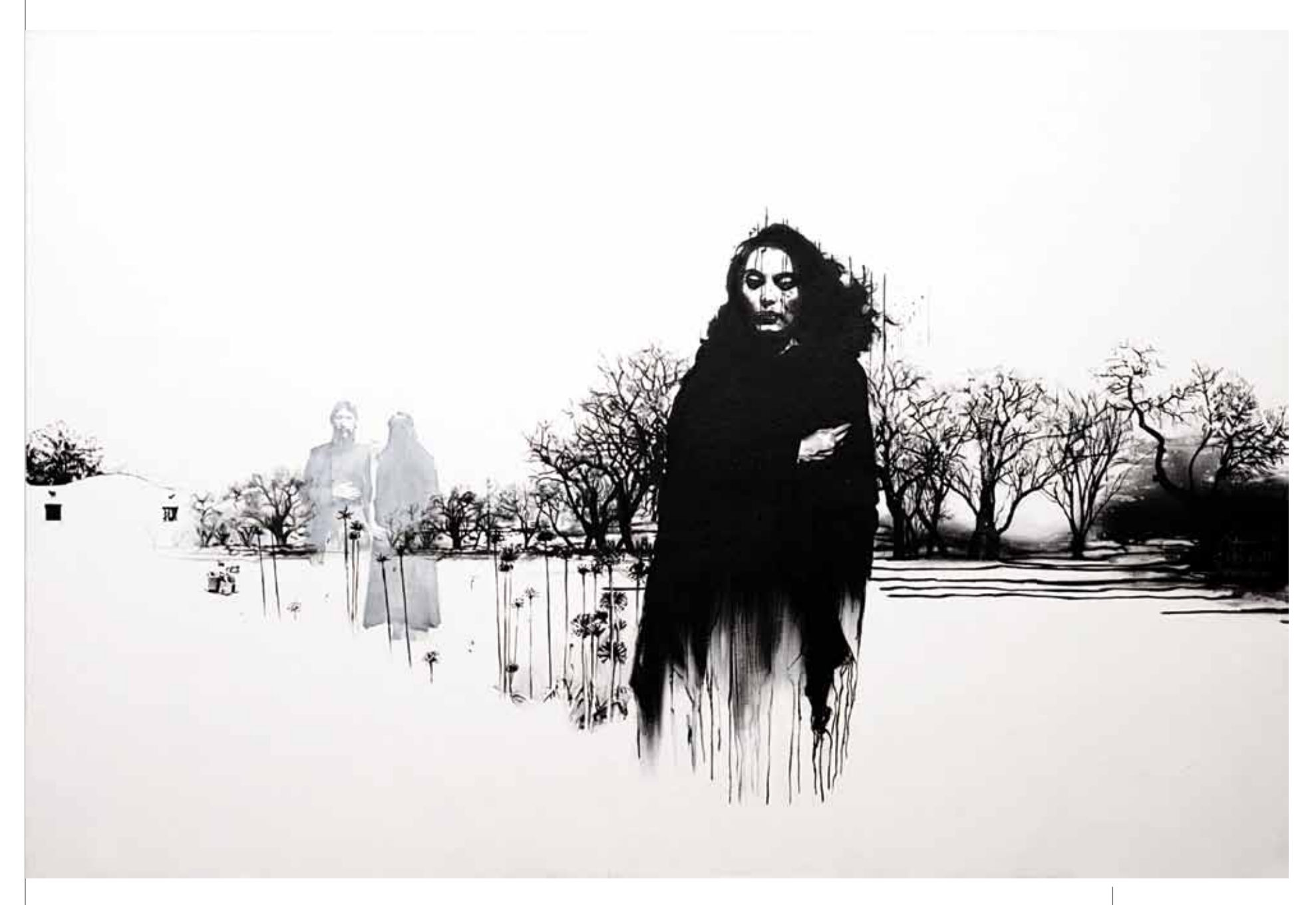
Dynasty 2012 Oil on Canvas 100 x 150 cm